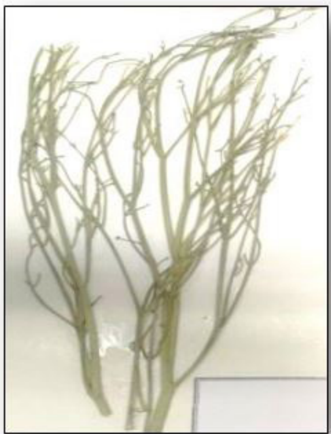
Figure 3: The collected plant, Ferulago angulate in its natural habitat, in Chaharmahal and Bakhtiari Province, south-western of Iran (original)