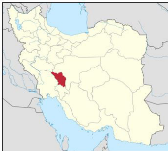
Figure 2: Collection site of plant Ferulago angulate in Chaharmahal and Bakhtiari Province in south-west of Iran

Plant identification: The plant was identified by experts in Department of Plant Sciences, Tehran University (Figure 3).