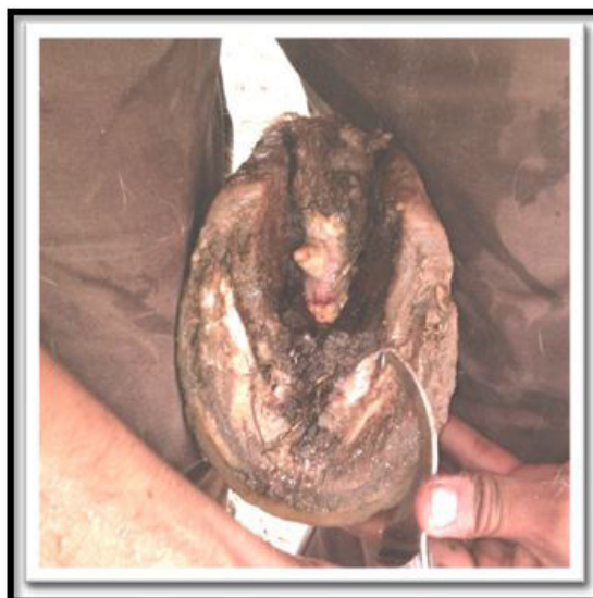
Figure 2: Trimming of hoof