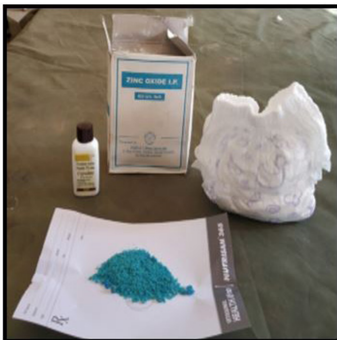
Figure 1: Medication for treatment of thrush

the group A (8.5 vs 11 days). Horses treated with medicine and trimming got prompt recovery than solitary treated with medicines. Statistical analysis also shows that there was apparently less median recovery time (8.5 vs 11 days) and significant increase of frog size in horses treated with trimming. Results show that therapeutic trimming helped in recovery of thrush by reducing time and also improve development of frog area by correction of hoof balance (Figures 1,2,3 and 4).