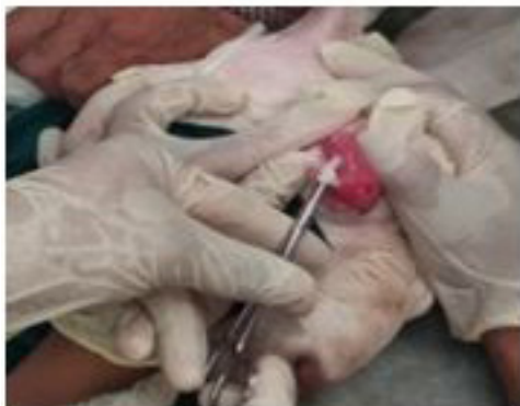
Figure 3: Cyst was surgically removed by a stab incision