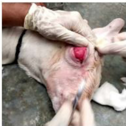
Figure 1: Blepharitis and congestion of conjunctiva membrane

Ultrasonographic examination was performed after restraining of kid, using a 6–8 MHz convex transducer. Ultrasonography of the affected eye confirmed the presence of a circumscribed anechoic area due to watery consistency in the retro bulbar muscle (Figure 2).