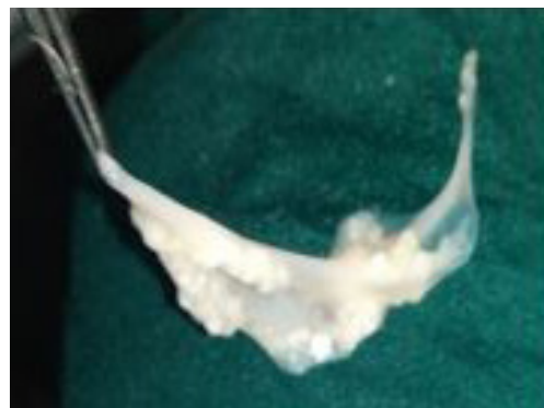
Figure 4: Proscolices in clusters attached to the internal surface